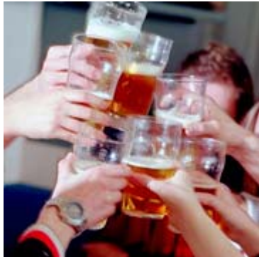
Alcohol-related incidents kill nearly 1, students in the U.S. per year